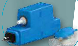
Sanicondens® Clim mini S

Sanicondens® Clim mini S comes with an anti-drain vacuum breaker as standard