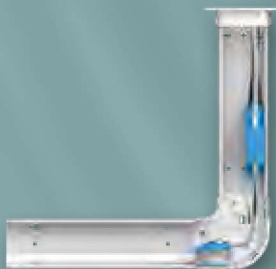
Sanicondens® Clim pack S

Sanicondens® Clim mini S comes with an anti-drain vacuum breaker as standard